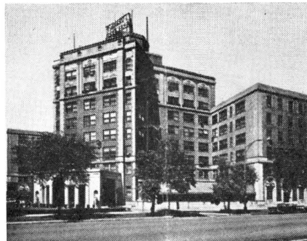
The Luxurious Graemere Hotel is the New Meeting Place for the Chicago Colored Church of God, Chicago Colored Spokesman Club and Wednesday Night Bible Study